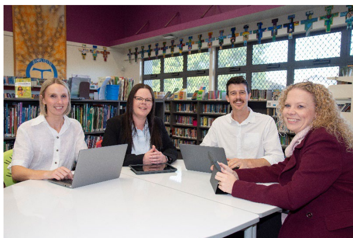
© Brisbane Catholic Education, St Francis College (2023)

Parent Slips – Parent/Caregiver permission for excursions.