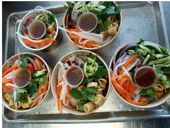
© Brisbane Catholic Education, St Francis College, KBD Canteen & Catering (2023)

A full “ Tuckshop Price List ” is available on the Parent Portal or the College office.