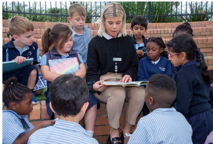
© Brisbane Catholic Education, St Francis College (2023)

A full version of the " Code of Conduct for Volunteers and Other Personnel " is available on the College website.