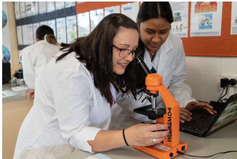
© Brisbane Catholic Education, St Francis College (2022)

A full guide to “ Fees and Levies 2024 ” and an “ Application for Concession on Fees ” form are available on the Parent Portal or the College Finance Office.