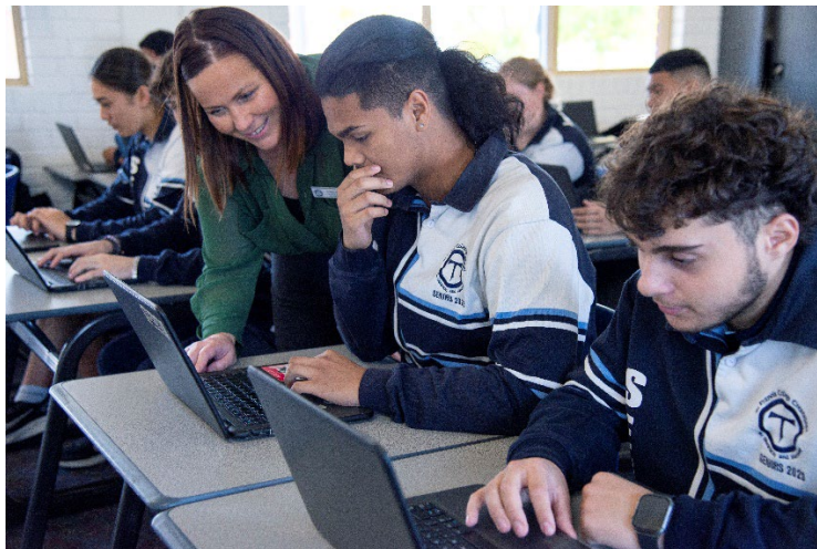
© Brisbane Catholic Education, St Francis College (2023)

It is the student’s responsibility to approach teachers for work to complete while they are away. We strongly suggest that all work be completed prior to the absence. For security reasons, exams cannot be completed prior to the set date.